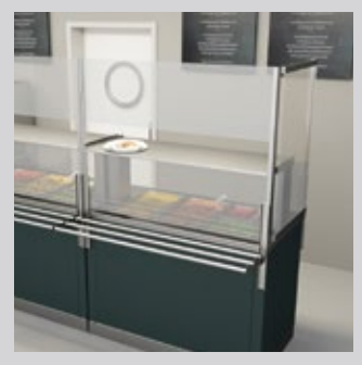
Pass-through option above the bridge attachment