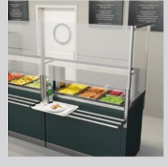
Pass-through option above stainlesssteel top surface (for instance, for children's and school catering)